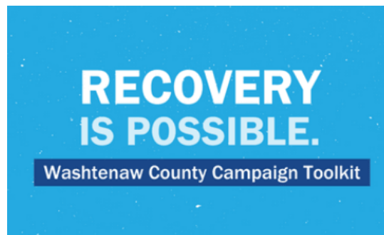
Washtenaw County Campaign Toolkit