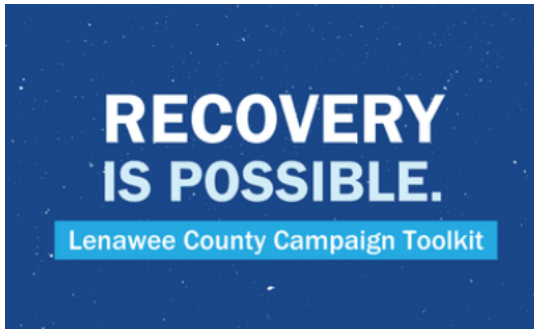
Lenawee County Campaign Toolkit