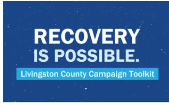
Livingston County Campaign Toolkit