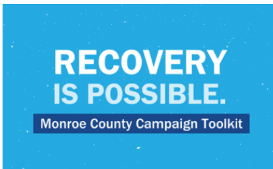
Monroe County Campaign Toolkit