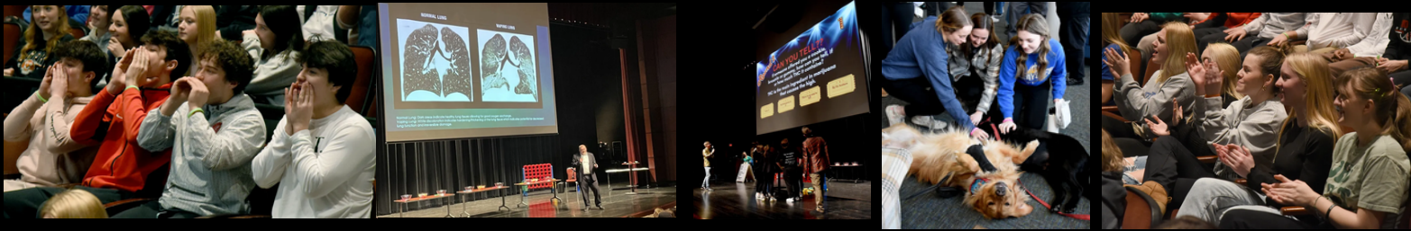
Pictures from the Monroe County #IMatter Youth Summit, which focuses on substance misuse prevention and mental health awareness and wellness